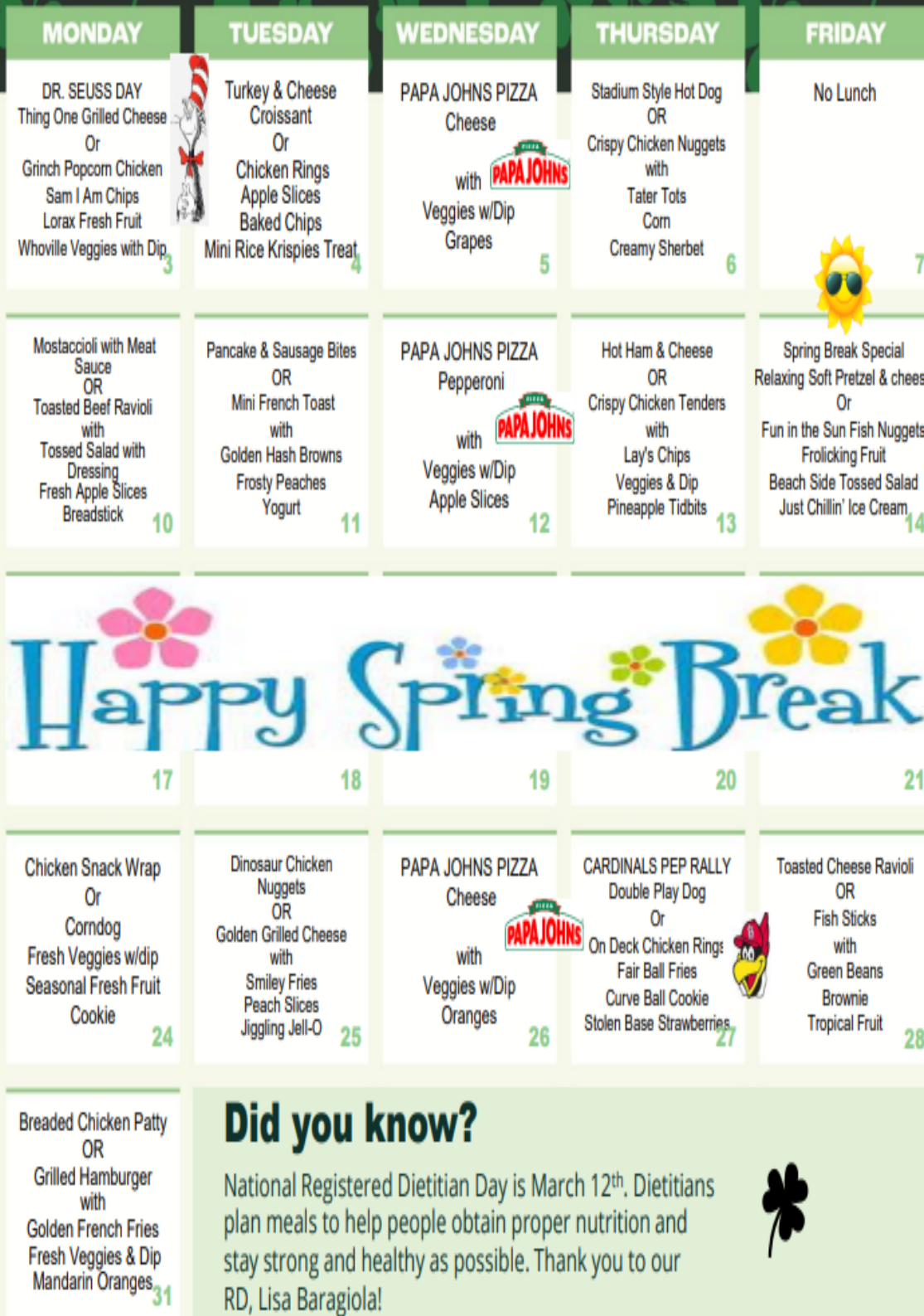
Plate Lunch Prices