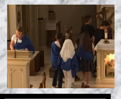
Stations of the Cross, from Mary's point of view, presented by the 4<sup>th</sup> grade.