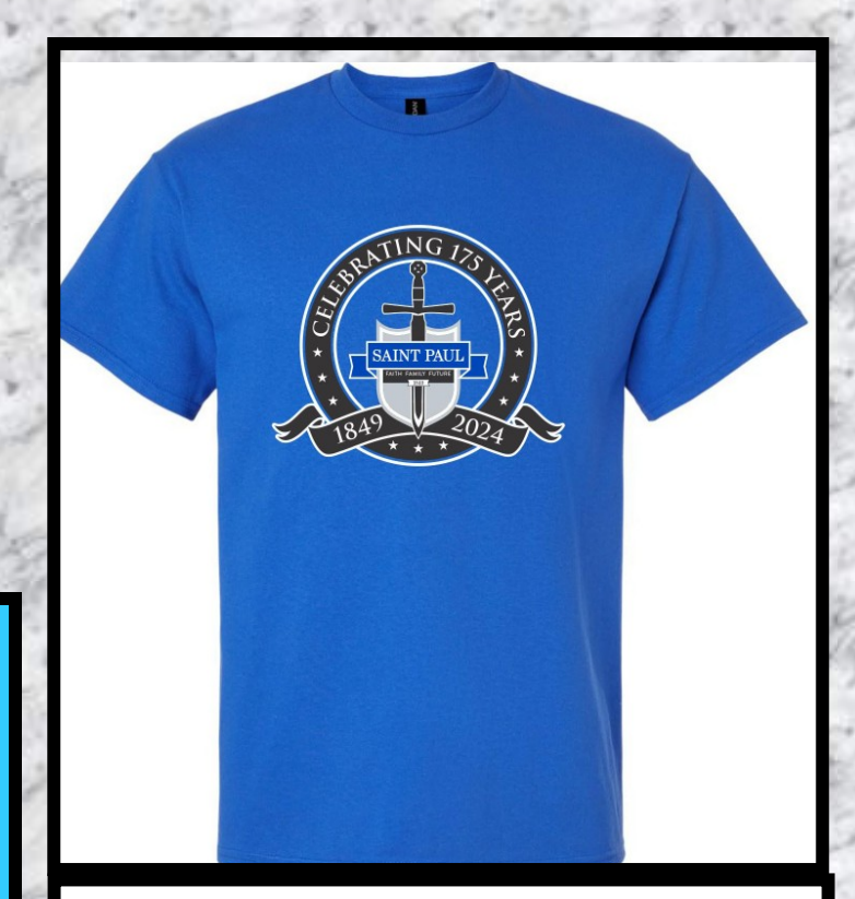
St. Paul 175th Anniversary Shirts are still available in adult sizes for $15.