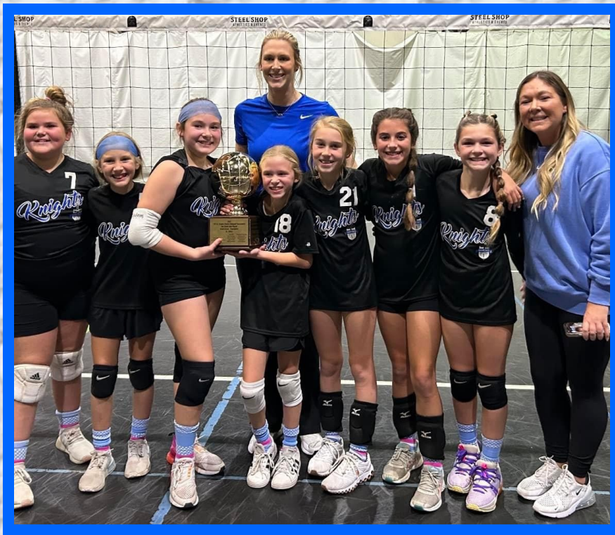
5 th Grade Girls Auchly - St. Charles County Post- Season Playoff Champions