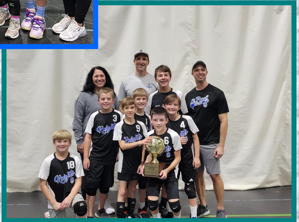
5 th Grade Boys Hawkins - St. Charles County Post- Season Playoff Champions