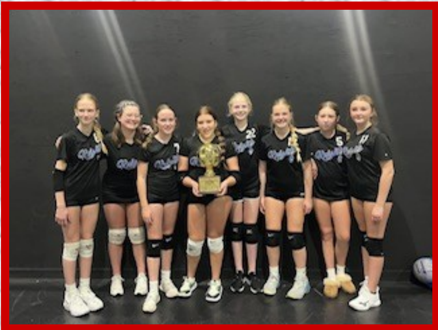
7 th Grade Girls Beckring - St. Charles County Post- Season Playoff Champions