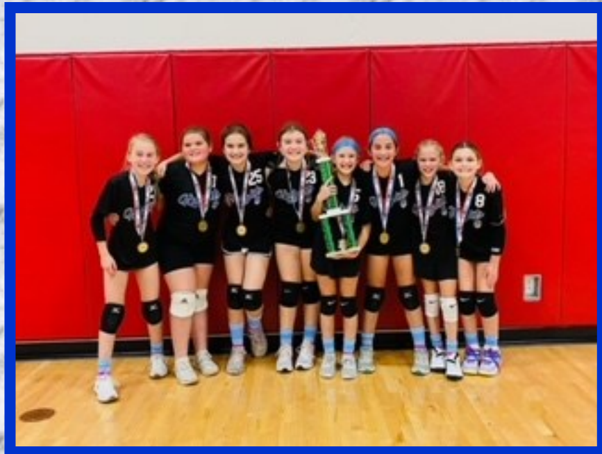
5 th Grade Girls' Volleyball (Auchly) - City/County Playoff Champions