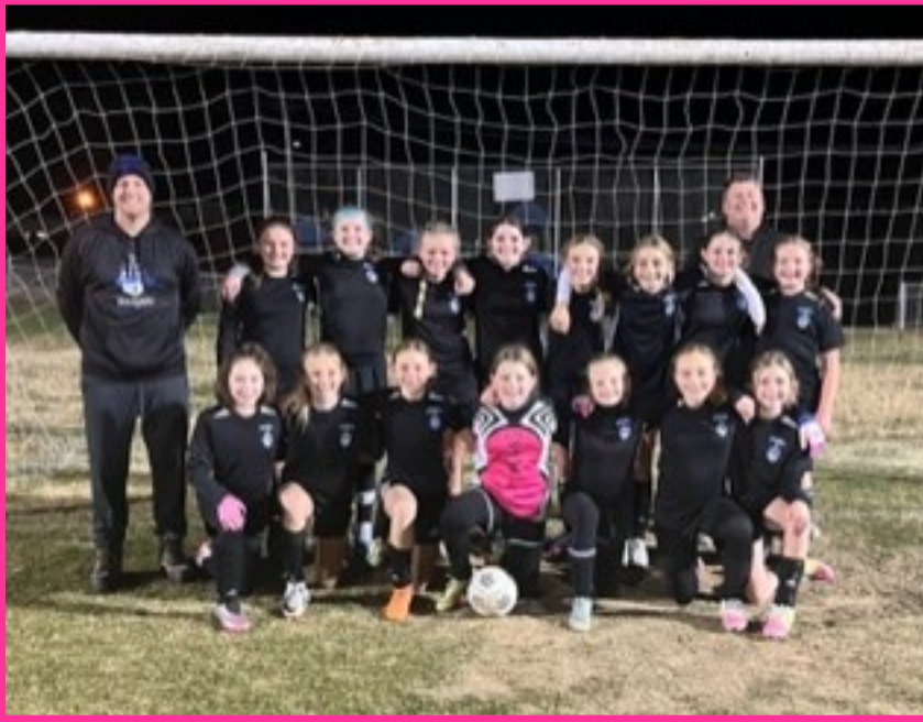
6 th Grade Girls' Soccer (Bange) - St. Charles County District Champions