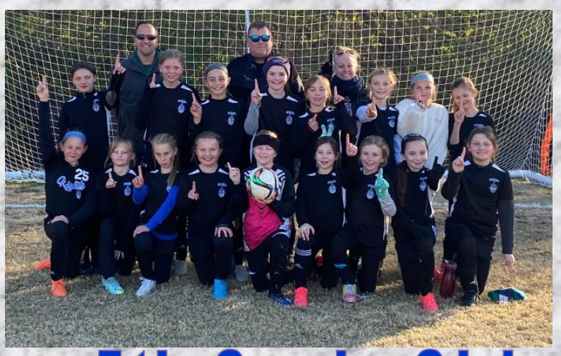
5th Grade Girls