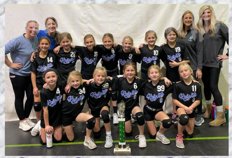
3rd Grade Girls