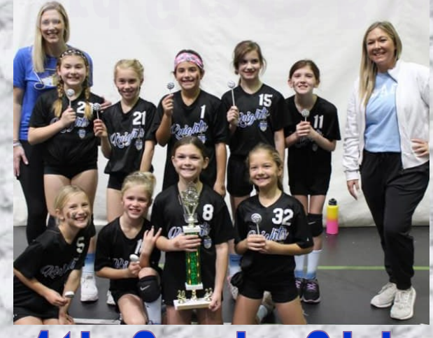
4th Grade Girls