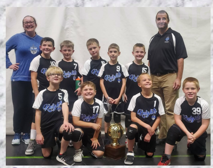
3rd Grade Boys