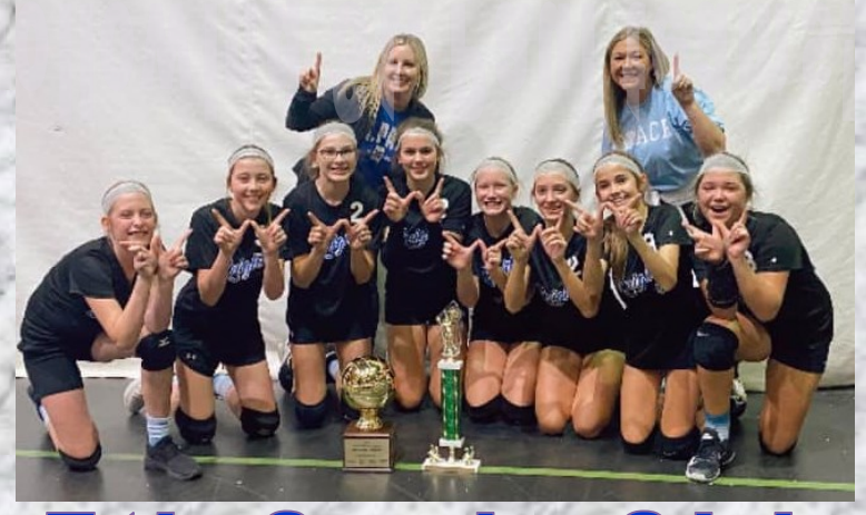
7th Grade Girls