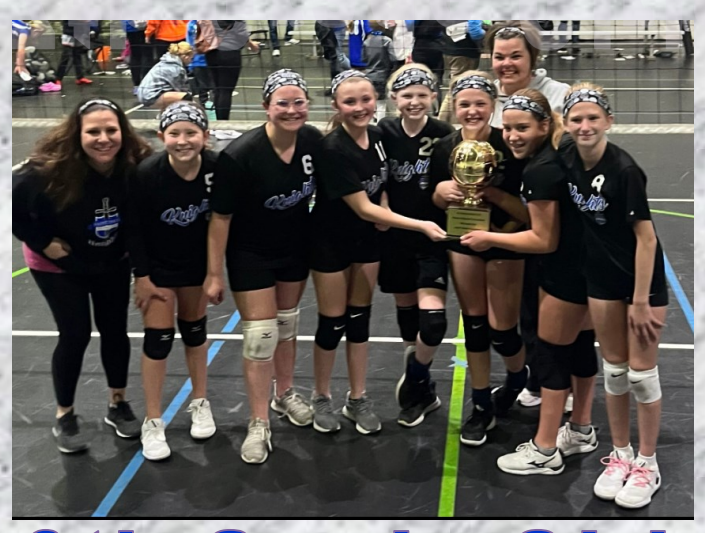
6th Grade Girls