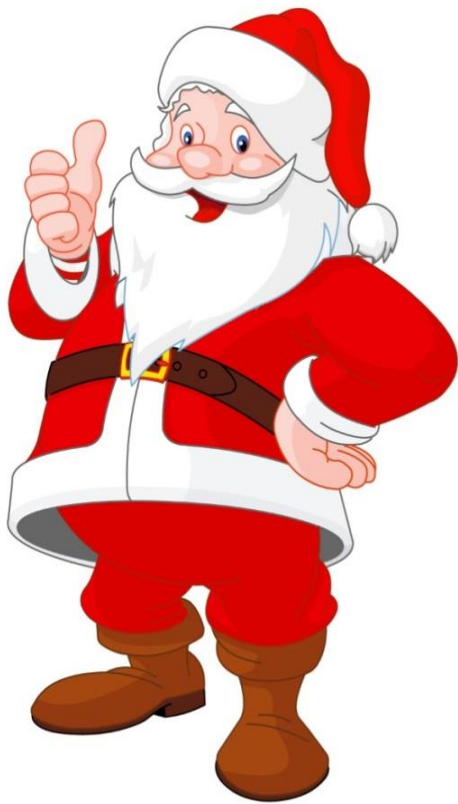
St. Paul School Fundraiser Sponsored by SPPPTO